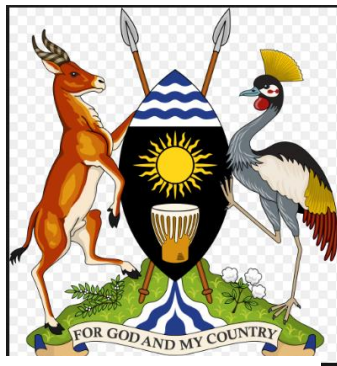
Ministry of Water and Environment