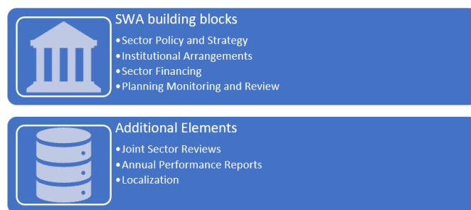
Figure 1: SWA Building Blocks

The findings of the report are available on a regional dashboard