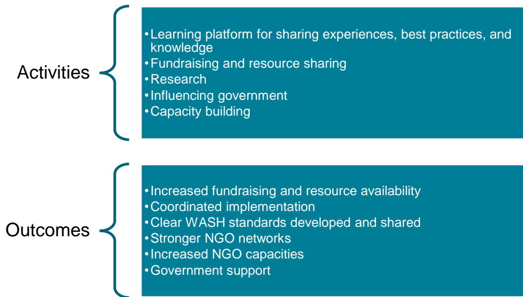
Figure 3 Desired activities and outcomes of a future NGO platform specifically for school WASH under the auspices of the AAEB