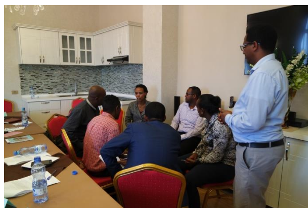
AAEB and NGO staff talking at the workshop.

This report is based on the analysis of the workshop outputs, as well as follow-up interviews with relevant NGOs in January 2018 that were identified as relevant during the workshop. Ten NGOs participated in the workshop, and seven organisations were available for interviews, bringing the reach of this study to 17 NGOs. The additionally interviewed organisations were Cheshire Foundation (CF), Ethiopian Orthodox Church Child and Family Affairs Organization (EOC – CFAO), Future Hopes Integrated Development Organisation (FHIDO), Islamic Relief (IR), Mothers and Children Multi-sectoral Development