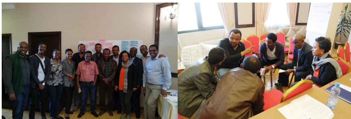
AAEB and NGO staff at the workshop...