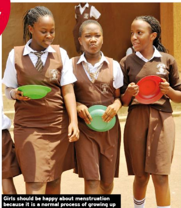
Girls should be happy about menstruation because it is a normal process of growing up

Boys should help take girls to the senior woman for extra help