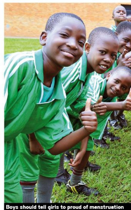
Boys should tell girls to proud of menstruation