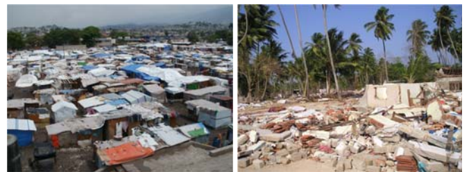
Wide variety of scenario