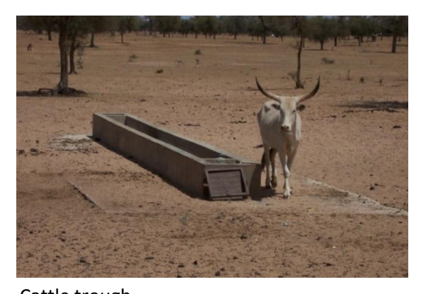
Figure 2. Example of productive use design features.

The household survey data show that the average household size in the 47 communities surveyed was 12.8 persons. The level of education and literacy among the survey respondents was low; 86% of respondents had no formal education. The majority of survey respondents were male household heads (58%). Female-headed households represented one-third of the respondents (31%), and the remaining respondents were either another adult female in the household (3%), a brother (2%), or an adult son of the household head (6%).