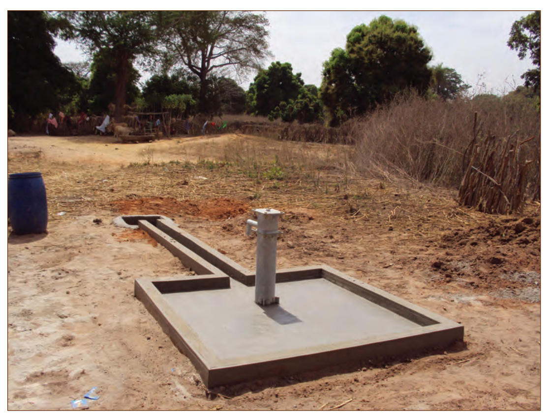
Concrete Apron and Hand Drilled Well

The RWSN hand drilling cluster group, see the website www.rwsn.ch