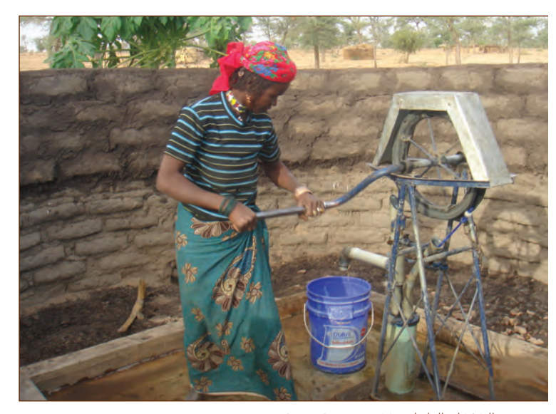
Rope Pump on Hand drilled Well

In parallel with the hydro-geology training and the practical training the businesses will receive business training. The training will be tailored to the well drilling enterprises and will cover: basic accounting, business management, business planning, access to finance, and preparation of tenders.