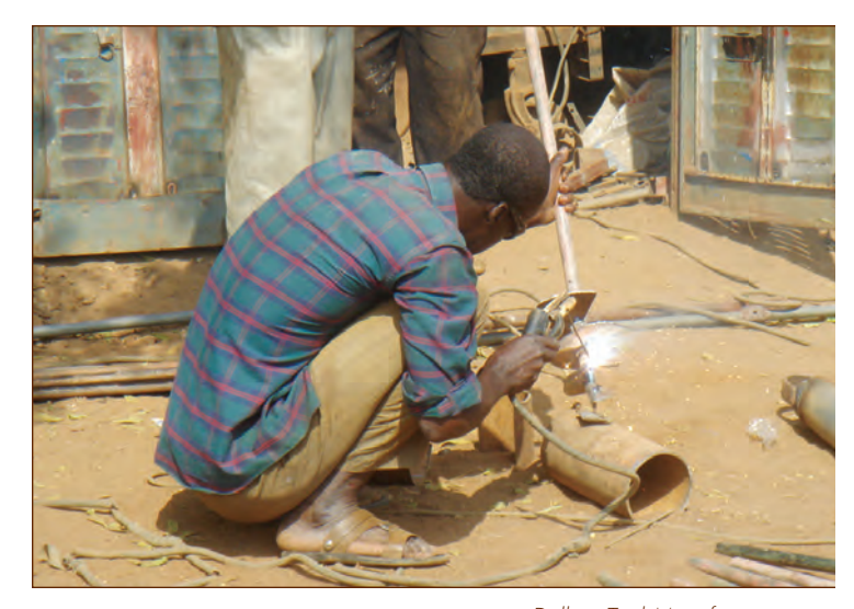
Drilling Tool Manufacture