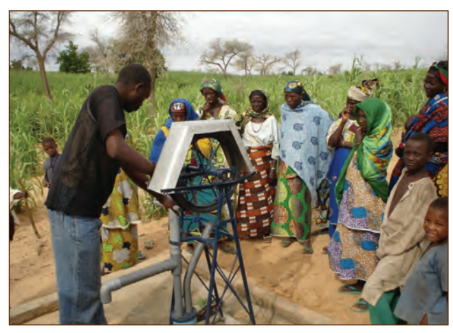
Rope Pump Training

Pump suppliers should train well drillers to install the pumps correctly to ensure that they reach their useful service life. Alternatively, the well drillers may subcontract the pump installation to the suppliers or to their trained agents.