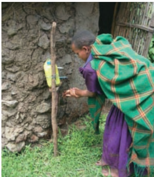
Installing a tippy-tap made from local materials, such as this plastic jug, is an easy way to create a hand washing station that also conserves water.

Hand washing prevents diarrhea effectively when done properly and at critical times. A recent meta-analysis of hand washing studies conducted in developing countries concluded that hand washing can reduce the risk of diarrhea in the general population by 42 to 44 percent (Curtis et al. 2003). Hands should be washed before preparing food, before feeding a child or eating, after defecating, after cleaning a baby or changing a diaper, and after cleaning up the feces of a person who is chronically ill. Proper technique includes using soap, or an effective substitute such as ash, rubbing hands together at least three times, and then drying them with a clean cloth or by air. Proper hand washing at critical times will help prolong and improve the quality of life of PLWHA and will help ensure the health and safety of family members and caregivers. A study in Uganda demonstrated that the presence of soap in the house was associated with fewer days with diarrhea (Lule et al. 2005), inferring that washing hands reduces diarrhea.