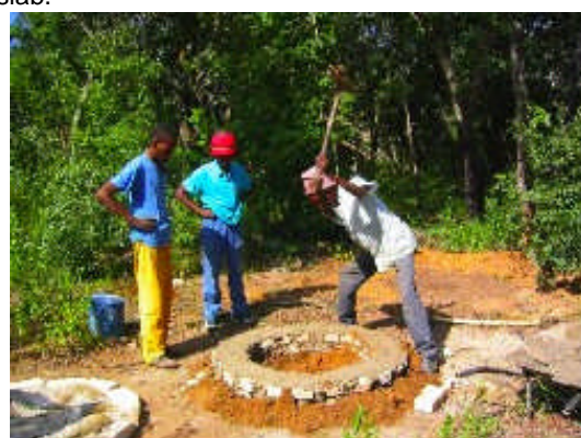
Figure. Digging inside the built beam or collar.

To start all that is required is part of a bag of cement, and some good river sand and thick wire. With this the householder can build a concrete slab, which will last for many years (actually a life time). The slab is mounted on a "ring beam" of bricks or concrete and a shallow pit is dug down inside the beam. A simple structure for privacy, made from locally available materials, is then built around the slab.