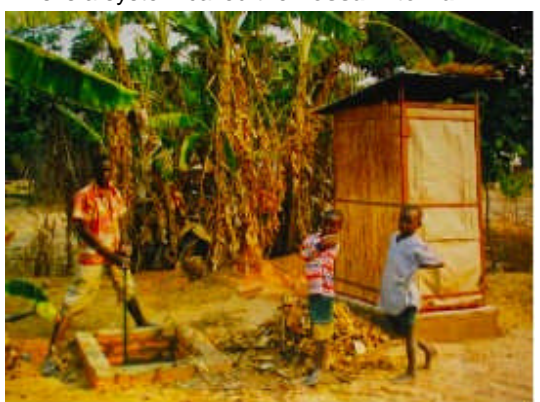
Figure. Fossa Alterna

If there is limited space on the compound or moving latrines is not preferred then it is possible to make two permanently sited pits and alternate between them at yearly intervals. The fertile compost can be dug out and used on the garden once a year. This is a system called the Fossa Alterna .