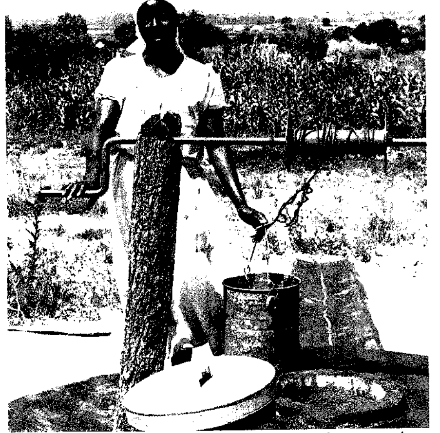
An upgraded family well showing the windlass mounted on stout poles, a raised collar forming part of the cover slab, and the tin lid provided in the 'subsidy'. Part of the apron and the water run-off can also be seen. The owners and users find this technology very acceptable.

The use of a bucket and rope, often in conjunction with a windlass, is one of the oldest and most dependable methods of raising water from shallow wells known, and it has been used in a variety of