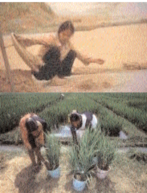
VIET NAM INDIA

Understanding the role of gender in water resource management requires attention to the complex relationship between productive and domestic uses of water, to the importance of participation in decision-making of men and women, and to the equitable distribution of benefits and costs from improved infrastructure and management structures. It also requires an understanding of the interactions between institutional, socio-economic, cultural and environmental ecosystem functions, dynamics and systems.