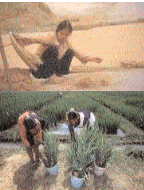
VIET NAM INDIA

Agenda 21 calls for the ‘development of public participatory techniques and their implementation in decision-making, particularly the enhancement of women in water resource planning and management’, and urges, ‘equality in all aspects of society... particularly as pertains to access to resources, credit, property rights and agricultural input and implements.’