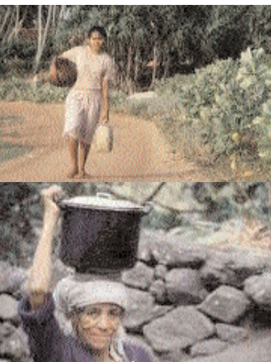
TOP: SRI LANKA BELOW: CAPE VERDE

Amongst users, one of the largest visible groups can be identified by gender. In most societies, the provision of water for fulfillment of fundamental human needs has always been a woman's responsibility. Women are responsible for preparing food, washing clothes, cleaning. Family hygiene is in their hands—and caring for the ill when hygiene is insufficient. In developing countries, women and girls spend an estimated 40 billion hours every year hauling water from distant and frequently polluted sources. Women have been reported to spend as much as 8 hours per day carrying up to 40.8 kg of water on their heads or hips.