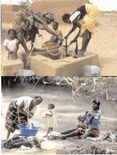
TOP: MALI BELOW: BURKINA FASO

'Of the 1.3 billion people in absolute poverty,' states UNDP's 1995 Human Development Report, 'the majority are women.' Poverty is growing among women partly as a result of an increasing absence of men from the household unit. In Sri Lanka, official census data show that one in five homes is now female-headed due to male deaths as a result of civil conflict. There, 70% of female agricultural workers work without pay or profit.