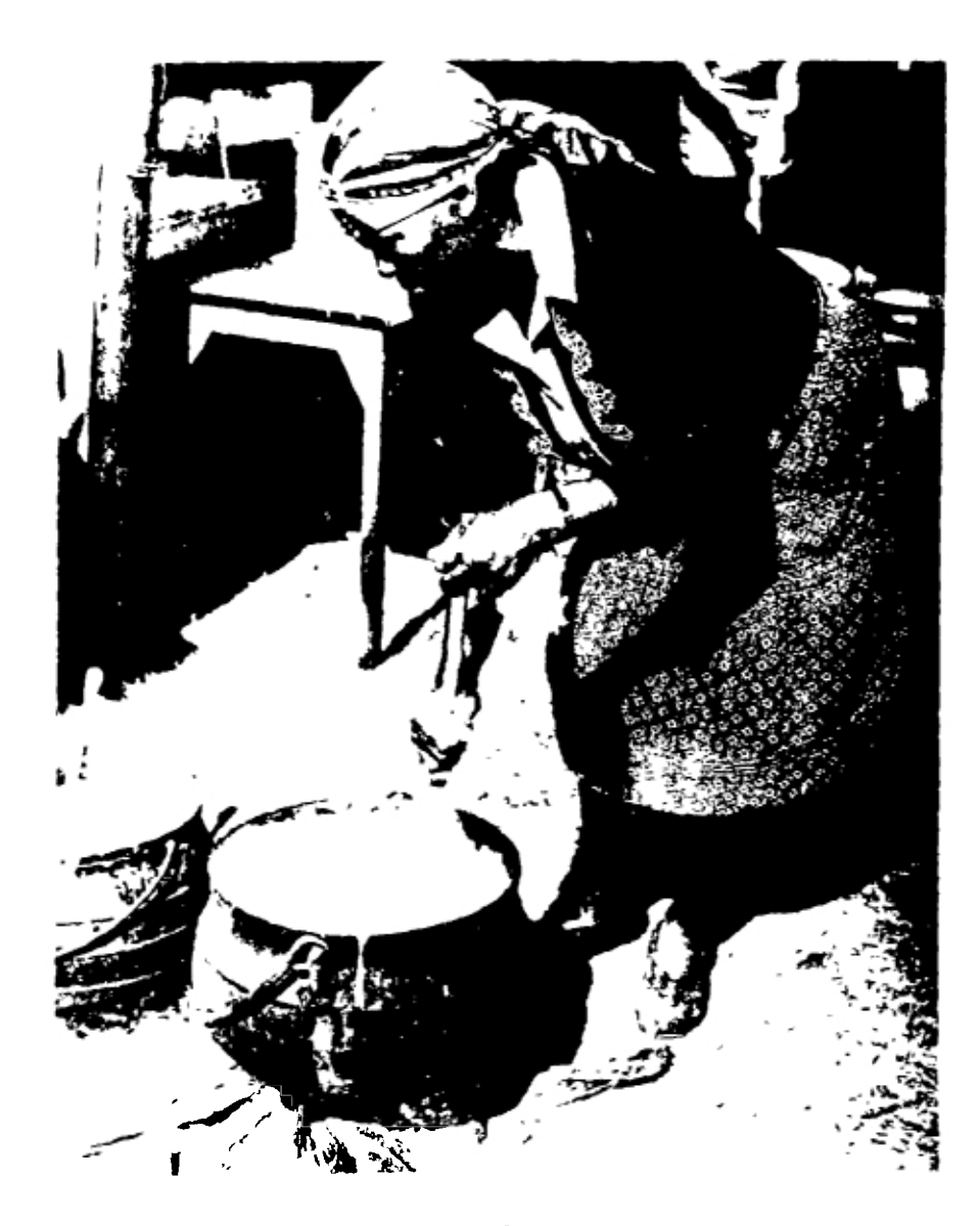
Woman cooking (Information Services)