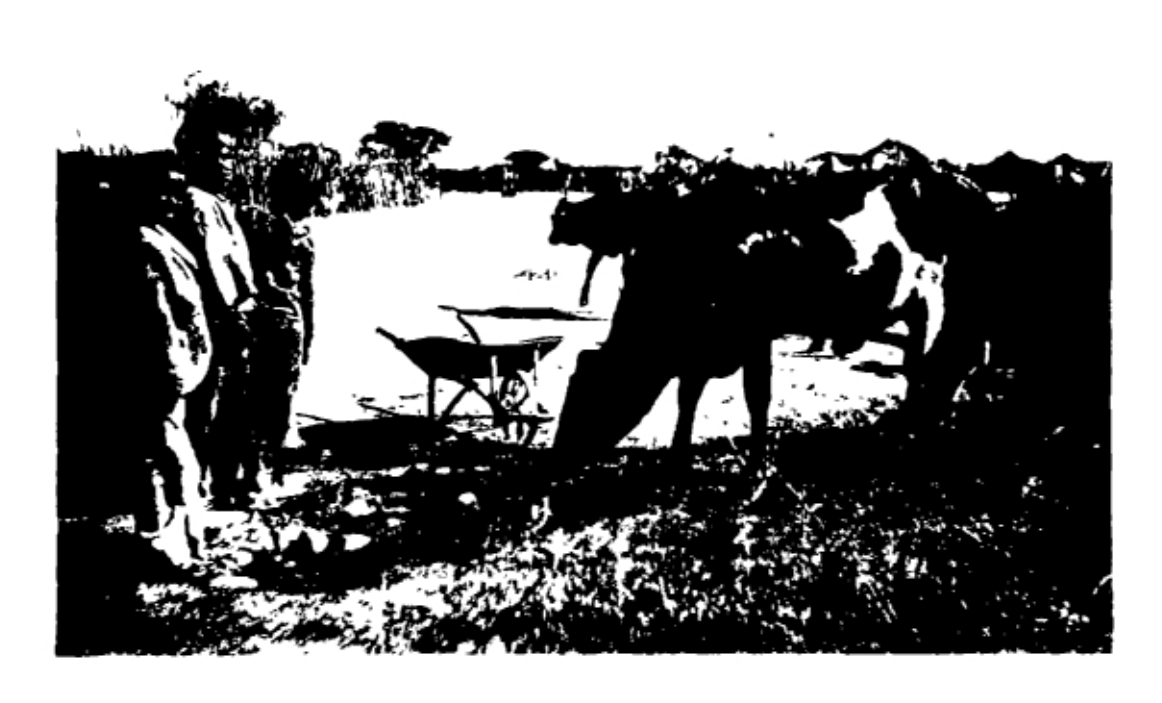
Cattle drinking from water around standpipes