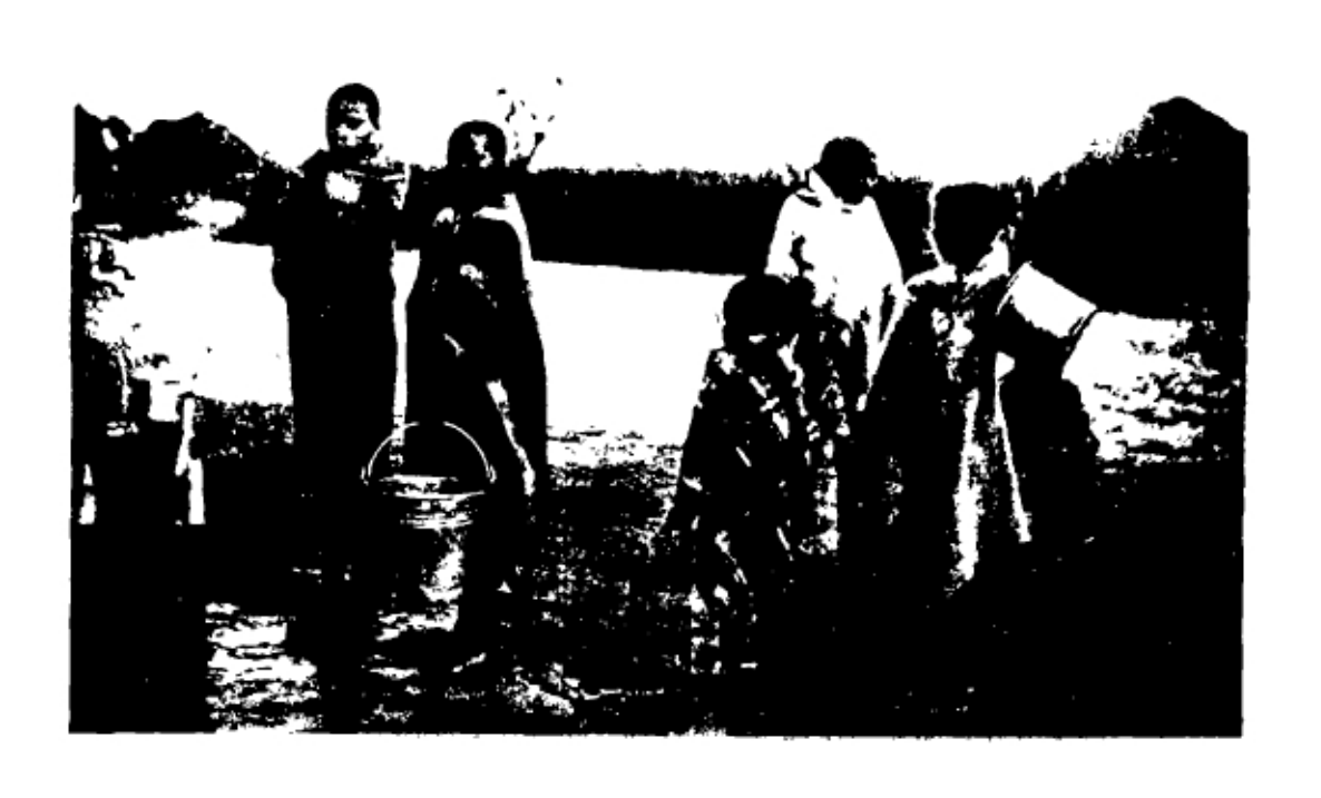
Evening queue at standpipe