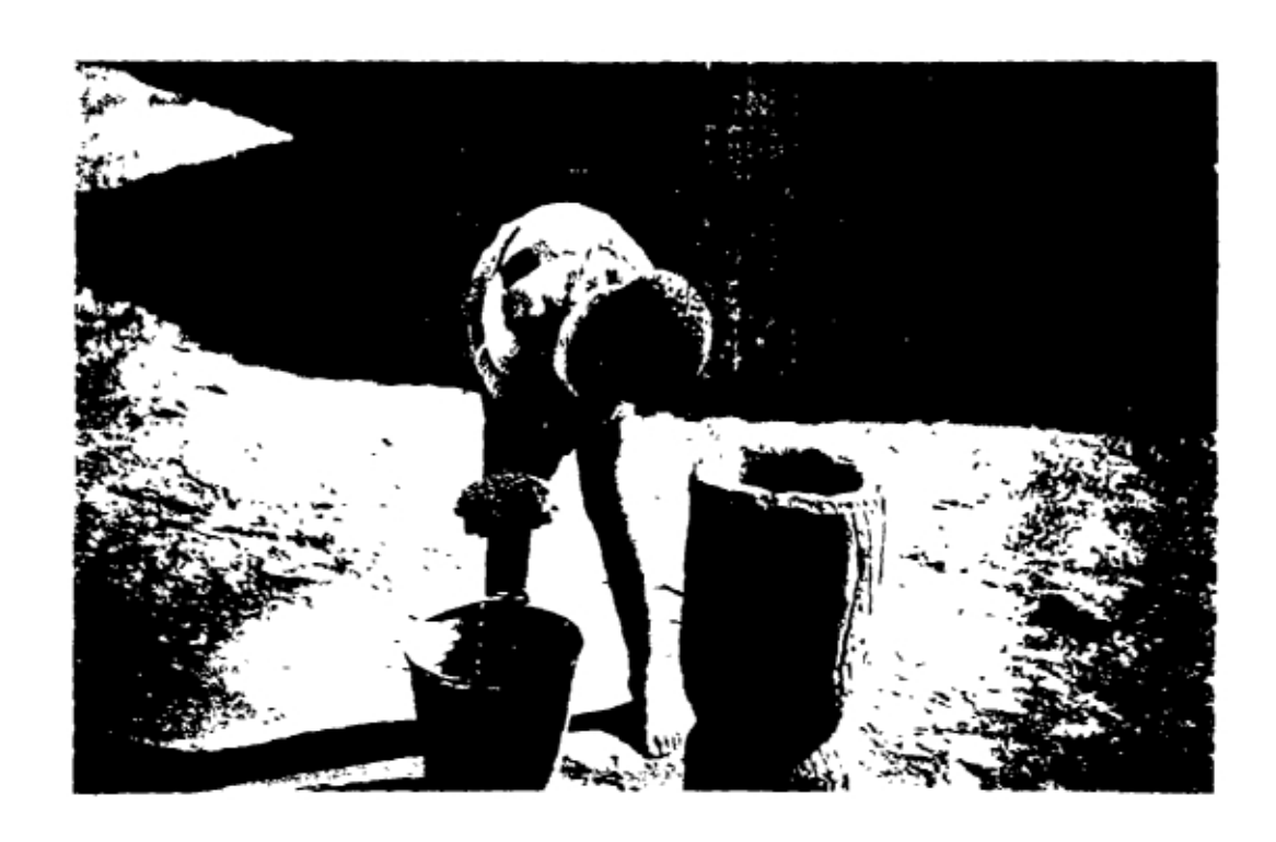
Stamping Sorghum to make porridge