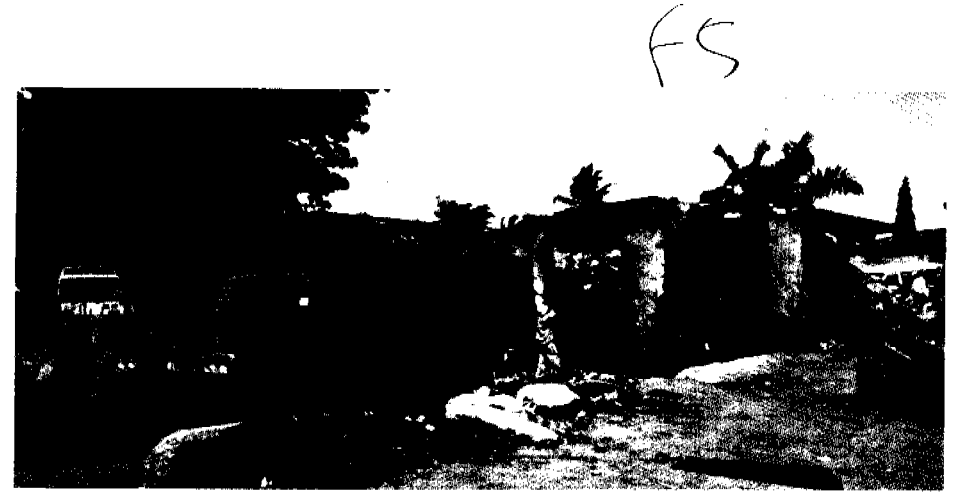
Providing secondary transportation to take collected waste to the disposal site can be a heavy burden for community-based groups working in low-income areas.

the awareness of leaders and other residents. There is a risk that community-based groups may become dependent on outside support, so there should be a strategy for phasing out of subsidised support. The dependence on voluntary inputs (for example dependence on unpaid work from senior members of the community) is another threat to the sustainability of this kind of arrangement. It is better to pay all who have extra responsibility because of the waste collection service.