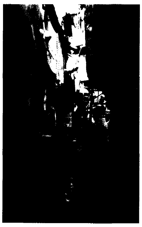
Difficult access in unplanned areas