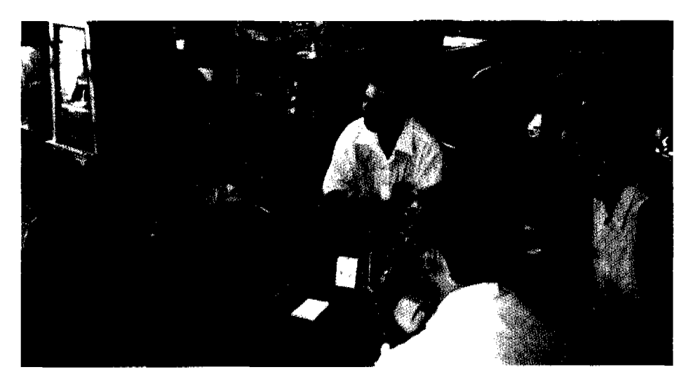
Community members should be involved in making decisions