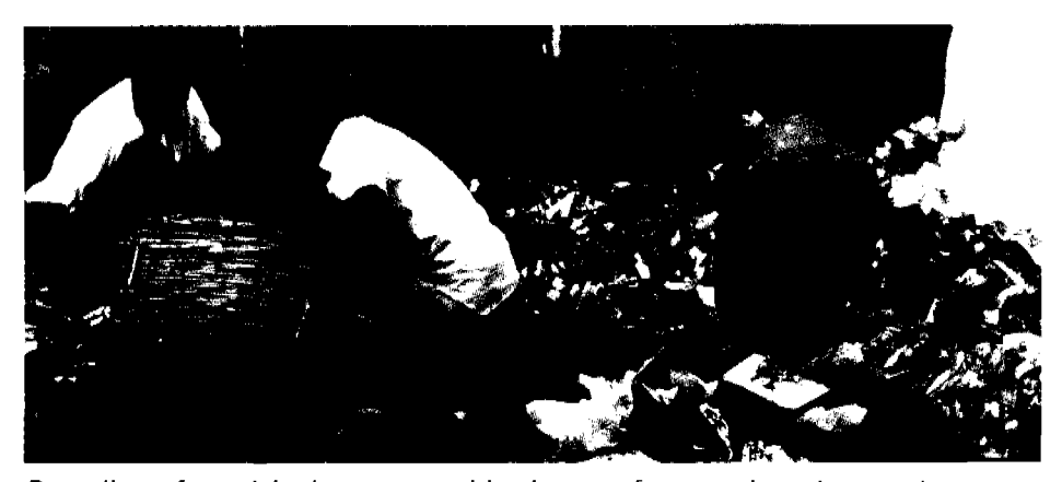
Recycling of municipal waste provides income for countless thousands. Household segregation could make this work more hygienic

and collection of waste should allow access for separation of usable material without the creation of a mess.