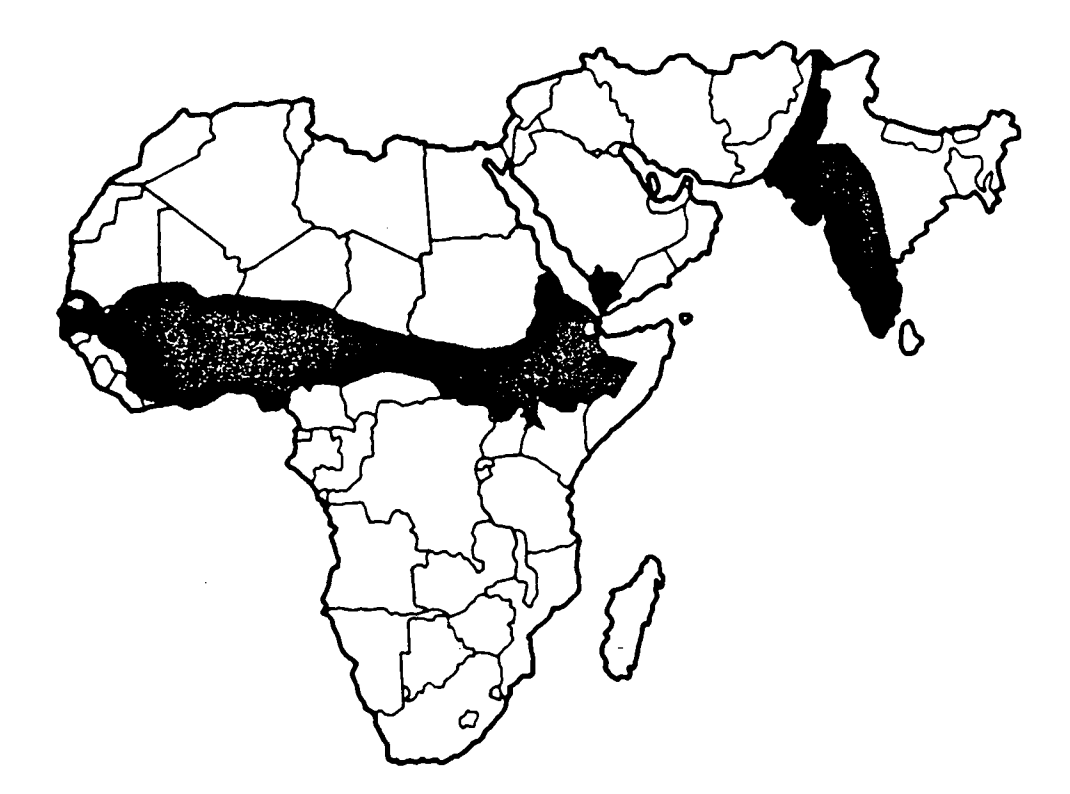
Figure 2. Areas in Which Dracunculiasis is Reported or Probably Exists