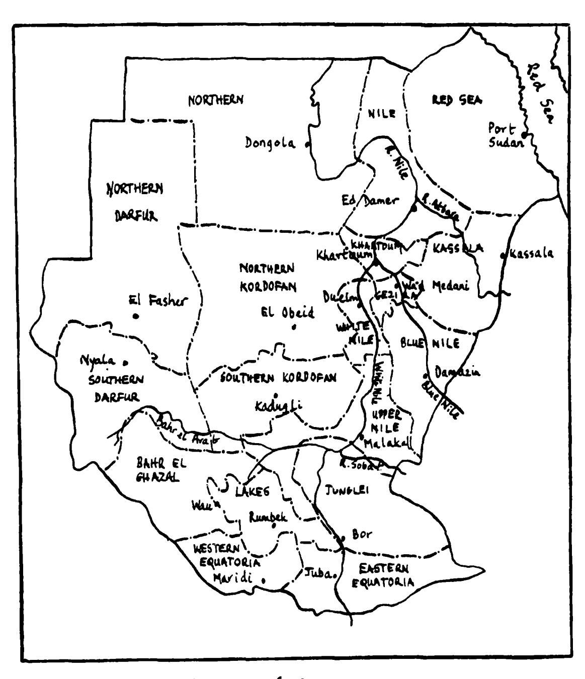
Figure 1: SUDAN