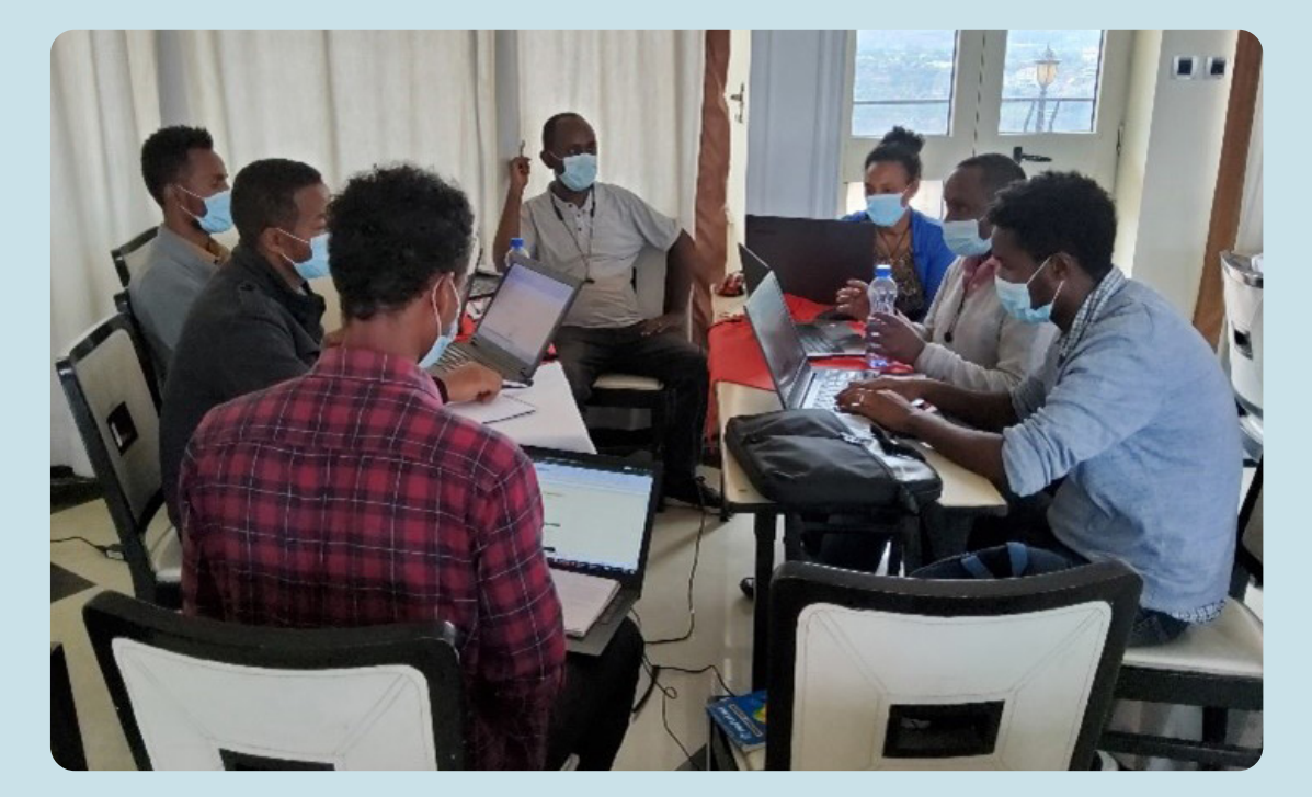
Participants discussing during a nine-day Training of Trainers (ToT) to the Ethiopian Water Technology Institute (EWTI) on WASH systems strengthening.