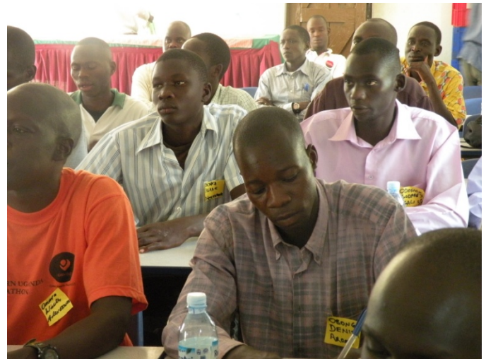
Hand Pump Mechanics attend refresher training in Lira district

The International Water and Sanitation Centre (IRC) and SNV Netherlands Development Organization are developing institutional capacity of HPMAs in the districts of Kabarole, Lira, Arua, Kasese, Bundibugyo and Kyenjojo. On top of their regular duties of repairing water sources, HPMAs in the six districts have taken up several activities such as;