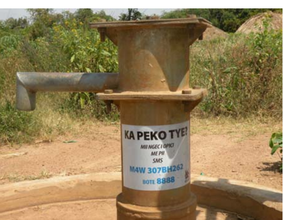
Above: Water sources clearly identified under the M4W initiative

None-functional water sources and regular acquisition of data for updating the District Water Management Information Systems at reduced