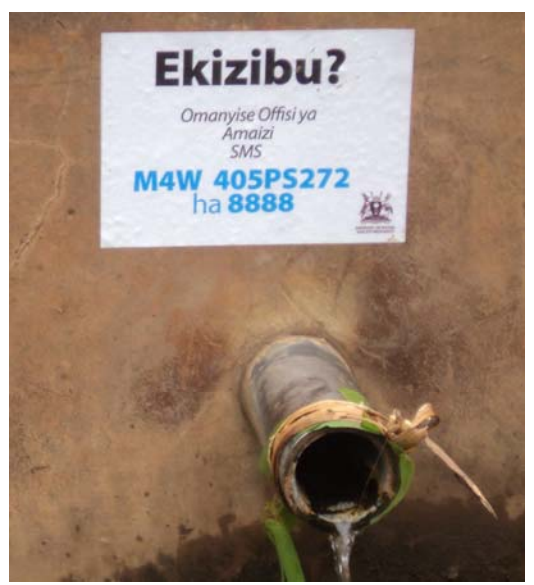
Figure 1 A protected spring well with M4W identification, Kabarole District