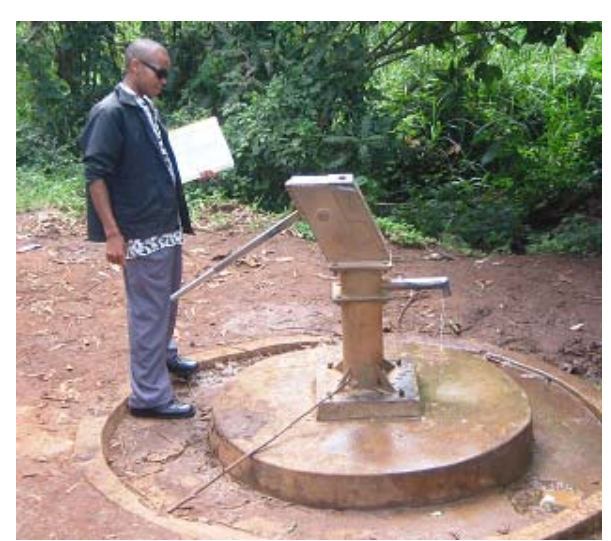
A Hand Pump Mechanic examines a faulty Shallow Well in Kisomoro Sub County, Kabarole District

The M4W system has strengthened the existence of Hand Pump Mechanics Associations and their ability to perform Operation and Maintenance support services in the 8 piloting districts where the initiative is being implemented. In April 2013, Lira and Kabrole Hand Pump Mechanics Associations were contracted by Triple-S Uganda to reinstall identifiers onto the water sources and conduct preliminary community sensitization on M4W in the 2 districts. Since then, over 100 new reports on faults have been received from the community.